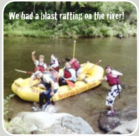
We had a blast rafting on the river!