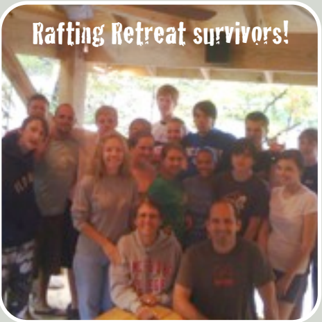
Rafting Retreat survivors!