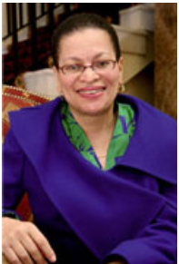
Dr. Julianne Malveaux