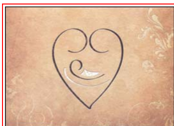
Baby Gift to Mission Card

For a gift to mission of at least $5.00, you can honor a child, and we will present the Gift to Mission card at our meeting. We hope that many of the children being honored will be able to come that day...it is a tradition that we look forward to every year!